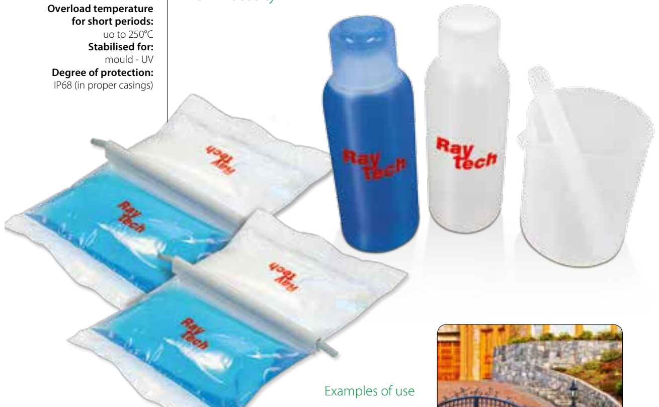
Examples of use